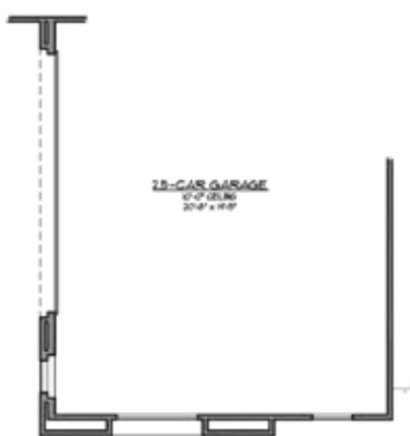
Optional 2.5-Car Garage