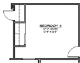
Optional Bedroom 4