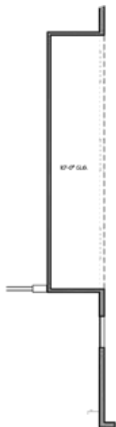
Optional 5' Storage at RV Garage