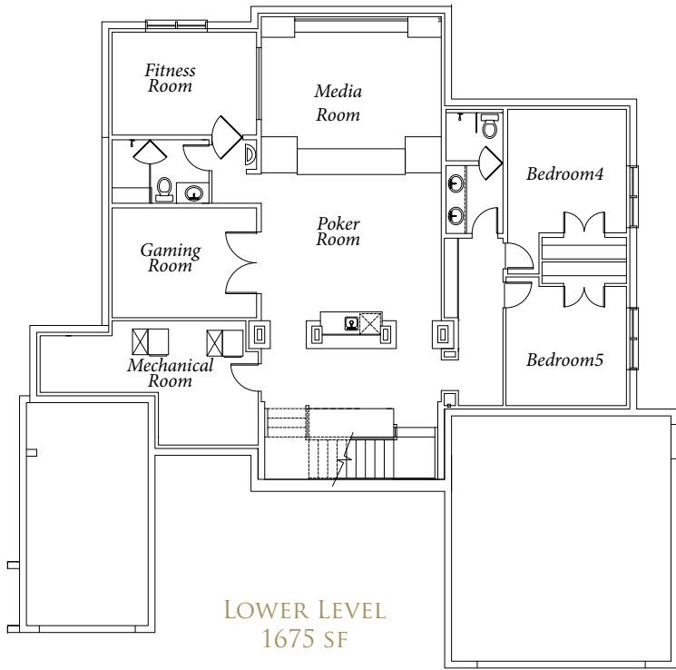
LOWER LEVEL 1675 SF