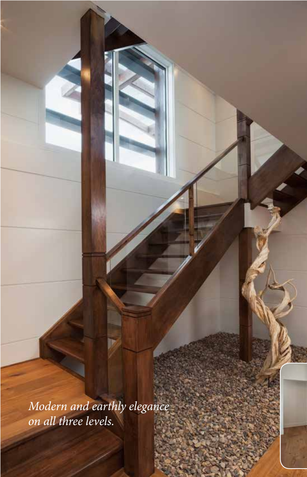
Modern and earthy elegance on all three levels.